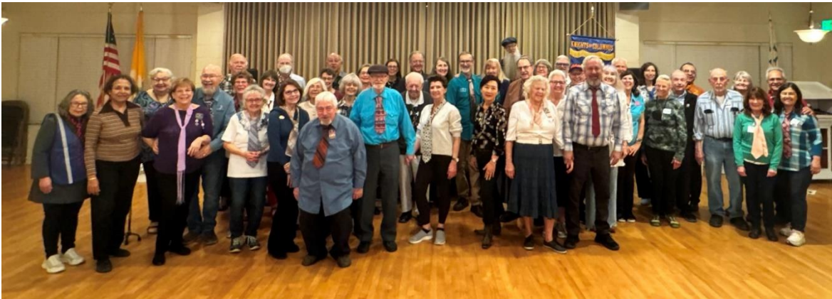
"Ugly Tie Dance" January 17 th